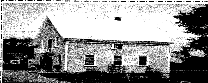
Purgatory Post Office and General Store—early 1940's

This month's meetings will be held on February 8th and 22nd at 10 am at the Senior Center on Academy Rd. FMI call or text 754-3931.